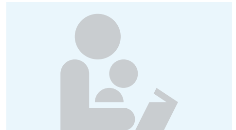
Reading at home