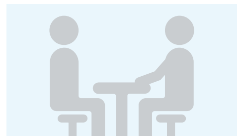
Participating in parent-teacher conferences