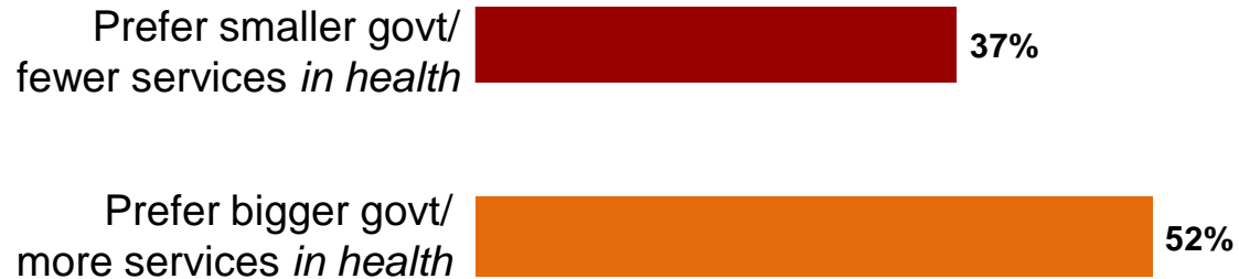
Chart 1. Public Preference for a Smaller Government Providing Fewer Services in Health or a Bigger Government Providing More Services in Health

CBS News/New York Times poll, April 2011