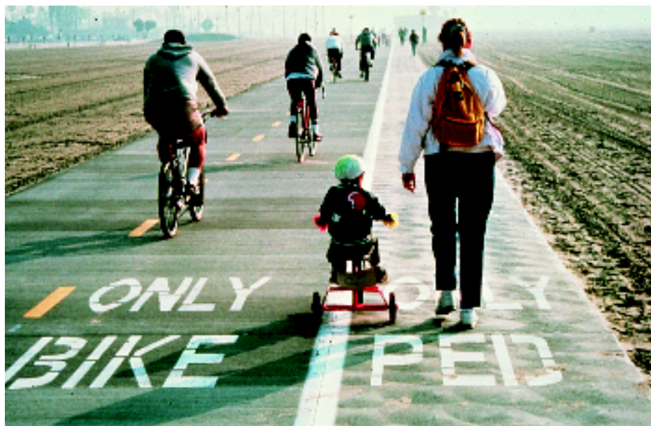
Bikers and walkers in Long Beach, Calif., enjoy safe, distinct paths, away from automobile traffic.

Published quarterly by the Communications Department of The Robert Wood Johnson Foundation® College Road East, P.O. Box 2316 Princeton, NJ 08543-2316