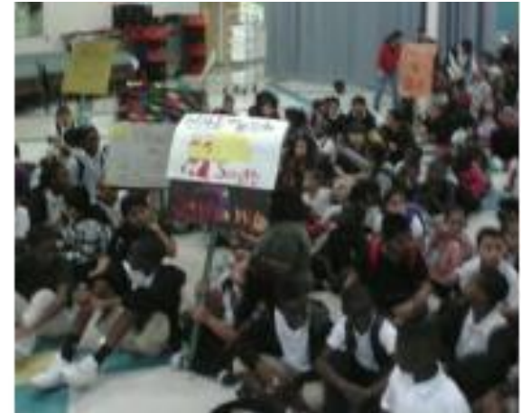
South Park Elementary - Memphis