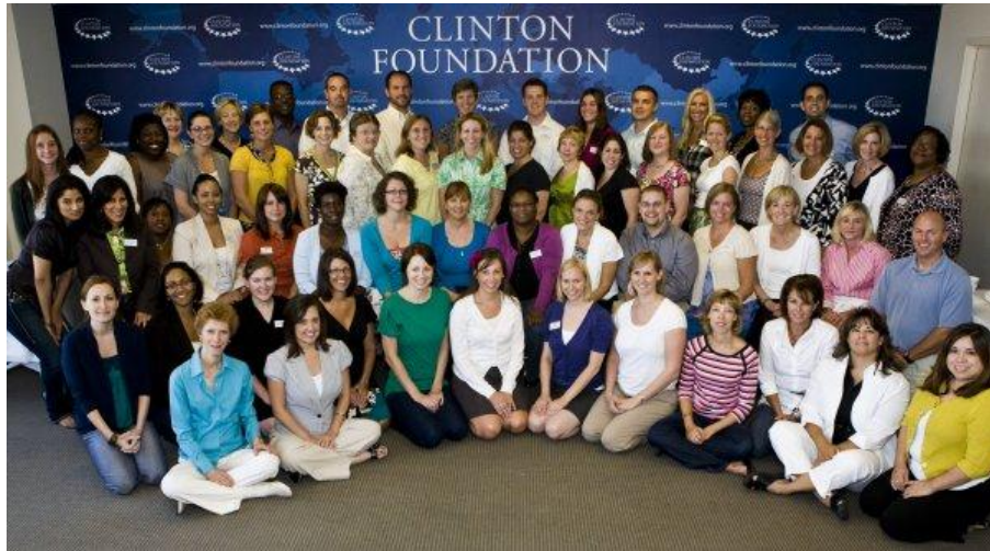
The Alliance Team

Healthy Schools Program Tool Comes in Handy Henry Co High School - Paris, TN National Success Story Posted Jan. 30, 2012