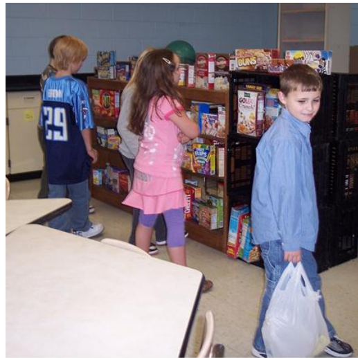
Students at the Special “B” Store