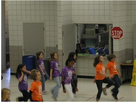
Bronze Awardee Arlington Elementary – Shelby – Flash Mob