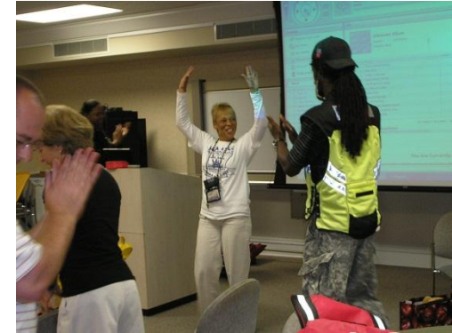
Memphis City Schools End of Year Celebration